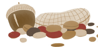
NUTS AND SEEDS